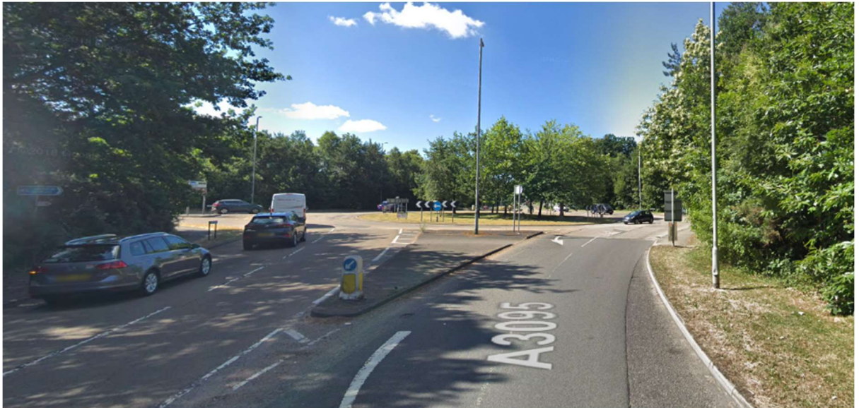
Photo 8 – Golden Retriever signalised junction looking south after improvements