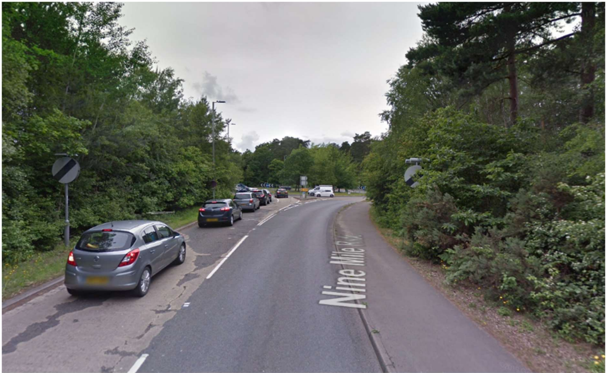
Photo 10 – Golden Retriever signalised junction exit looking west after improvements (image from Google Maps)