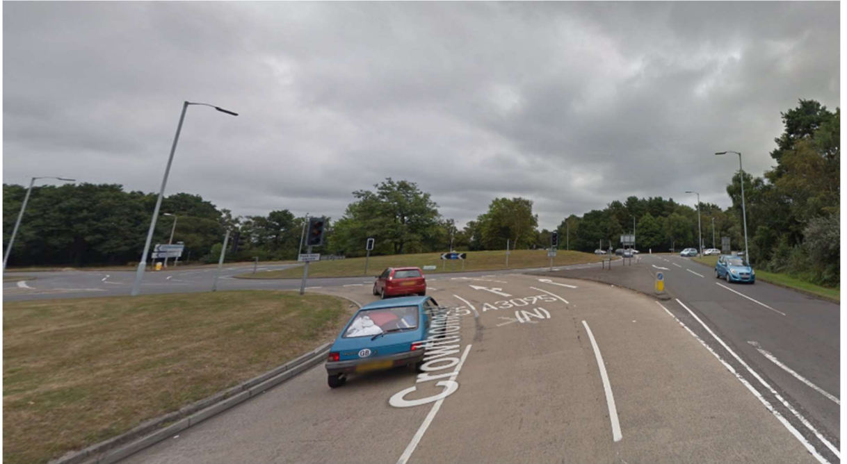
Photo 4 – Hanworth Roundabout looking north after improvements