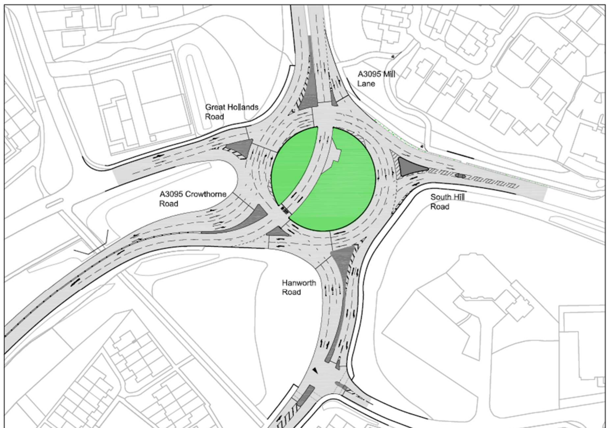
Figure 2 – Hanworth Roundabout