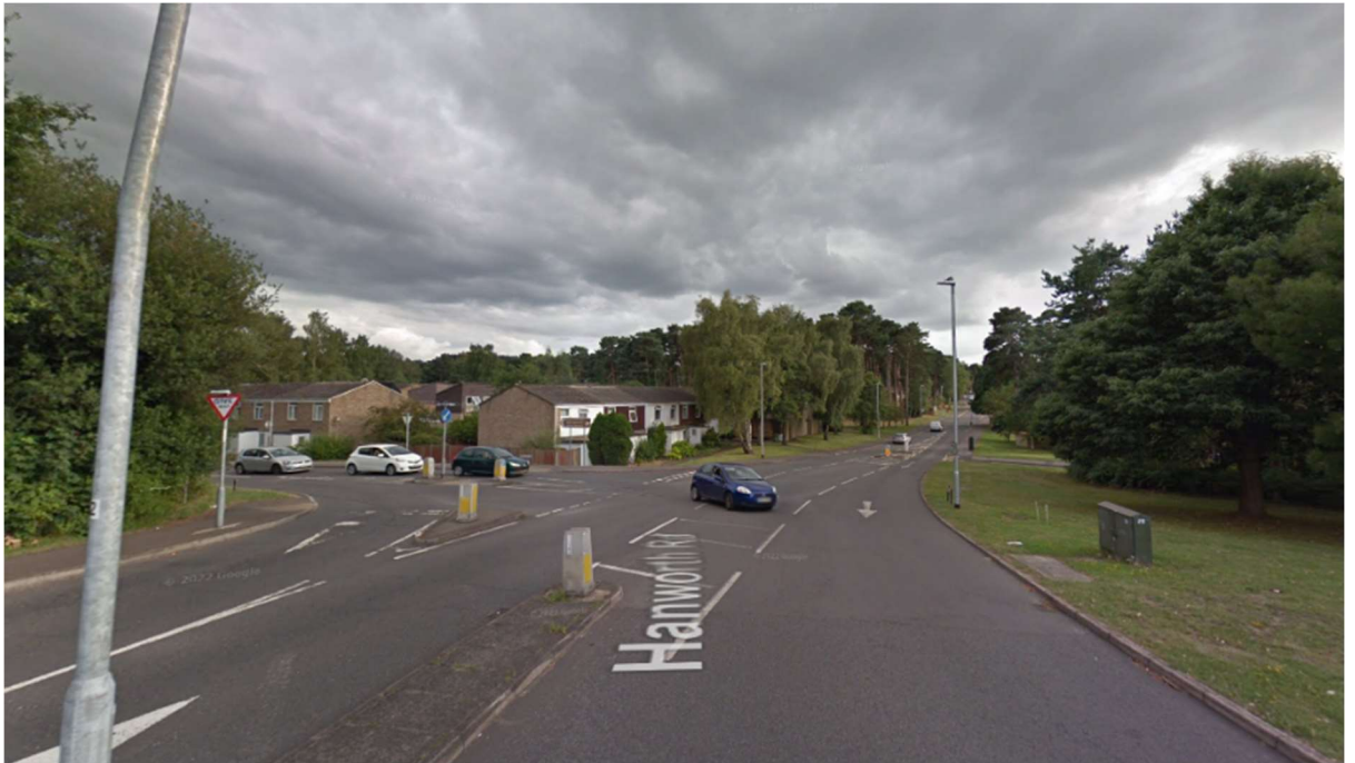
Photo 6 – Hanworth Road / Ringmead after improvements (image from Google Maps)